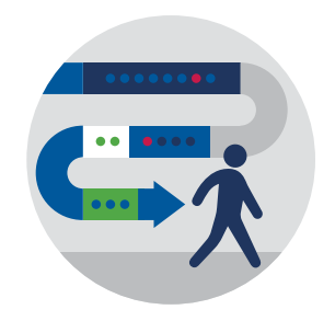
Keeps movements, actions and events recognizable